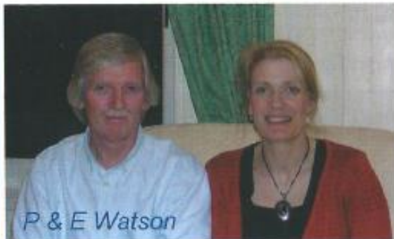
P & E Watson

Please phone – (023) 9237 5170 Also evenings and weekends We are happy to quote for just one window, unlike many larger companies