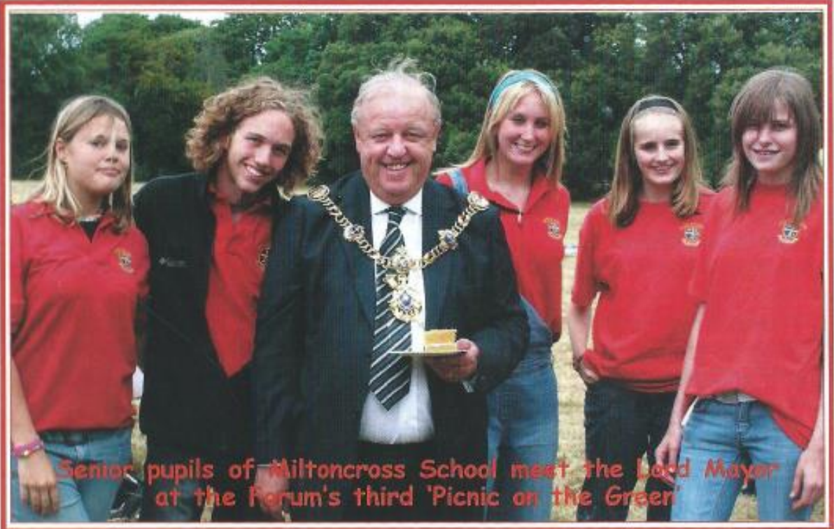
Senior pupils of Miltoncross School meet the Lord Mayor at the Forum's third 'Picnic on the Green'

Milton Neighbourhood Forum September 2005