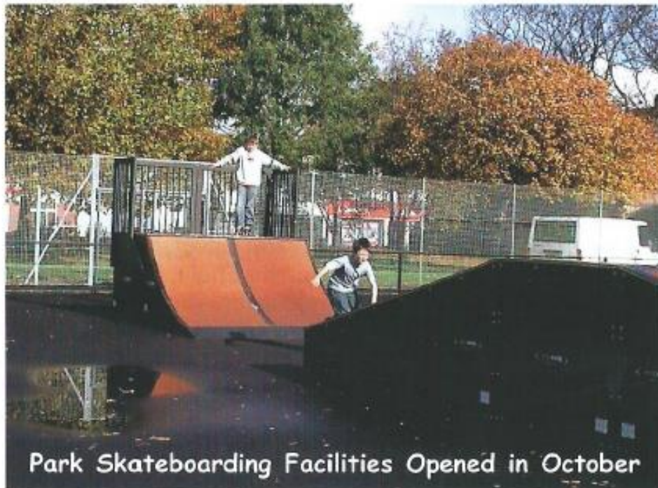
Park Skateboarding Facilities Opened in October

In this Issue - Your Forum Needs You! - See pages 2 & 9 Milton Park Tree Dressing - page 8 Plus - Local news, reports, information and services