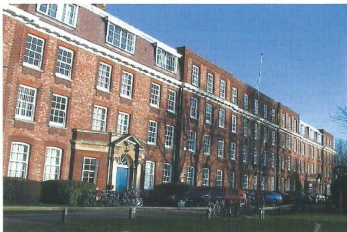
Farewell Foster Hall – the Milton Campus University building which will be demolished this year hence a new venue for our Forum