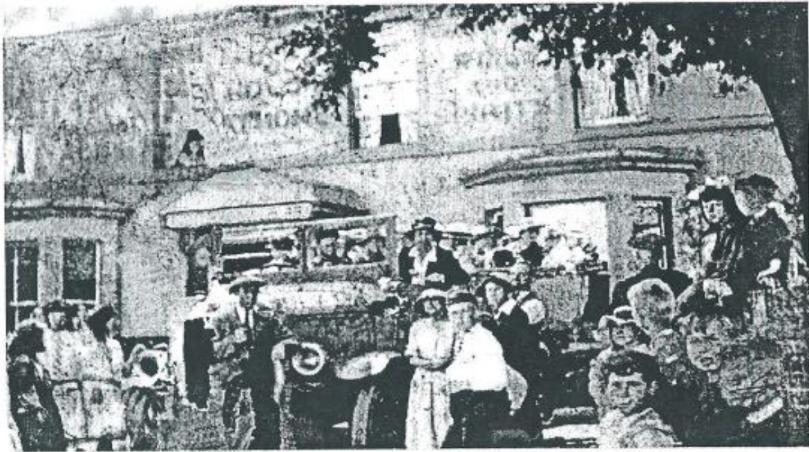
The Old House At Home (See Article on Pages 4&5)