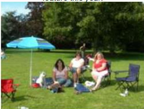
The weather was great and picnics were as popular as ever!