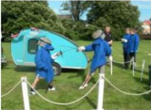
Fencing demonstrations were a new feature this year.