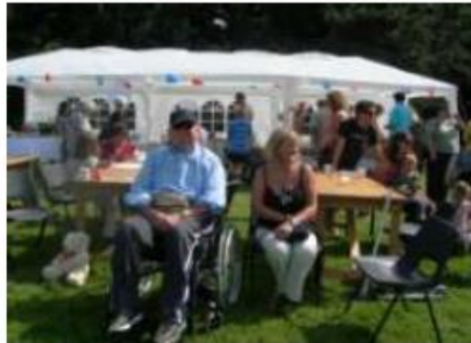
Just enjoying that glorious sun