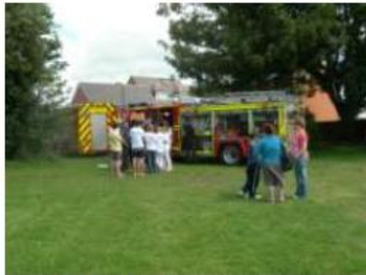
All the children wanted to be Firemen