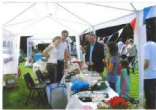
Sterling service on the Tombola