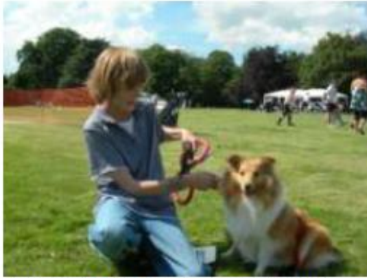
Winner of Dog Most Like His Owner