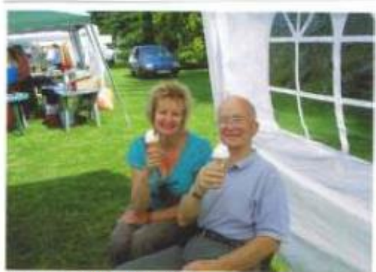
A nice day for an ice!