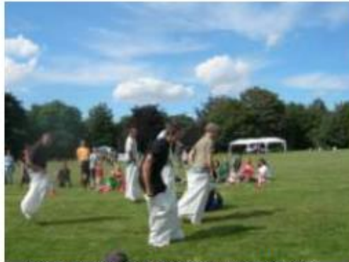
The ever-popular men's sack race