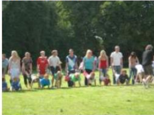
Family Wheelbarrow Race