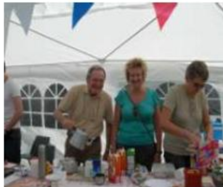
Anyone for tea and cake?