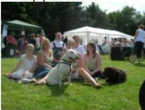
Dogs are always welcome on the St. James Field and can bring their families too!