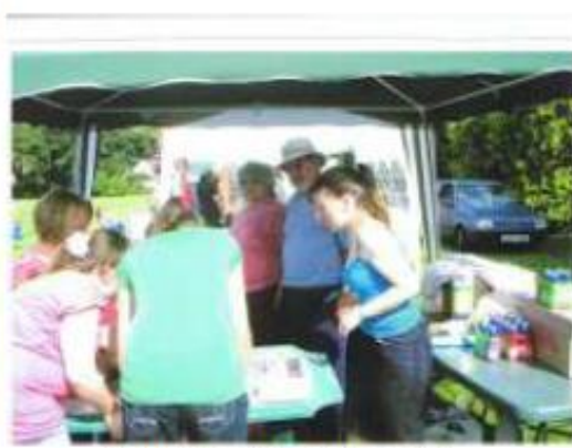
Come along, fun for all