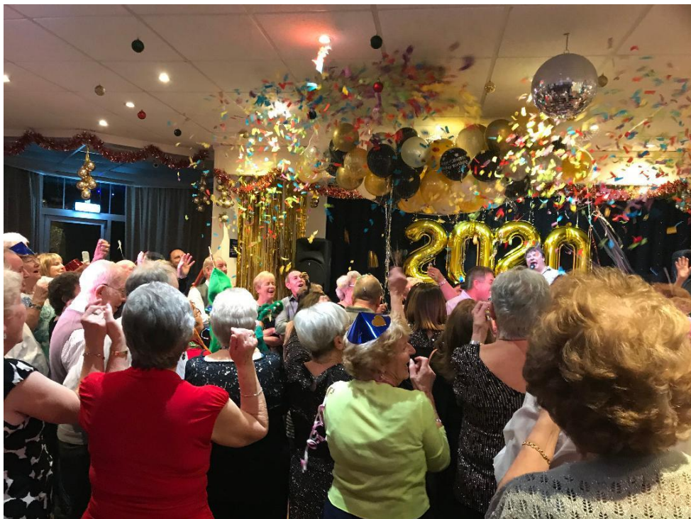
Milton Village Community Association Members enjoy New Year's Eve in Torquay