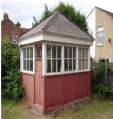
The office as it stands today

Paul Knight, City of Portsmouth Preserved Transport Depot