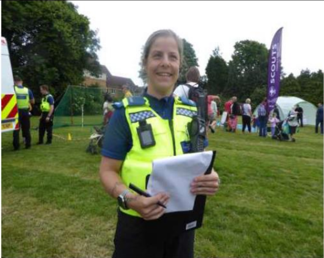
A welcome face at June's Picnic on the Green where everyone was having fun!