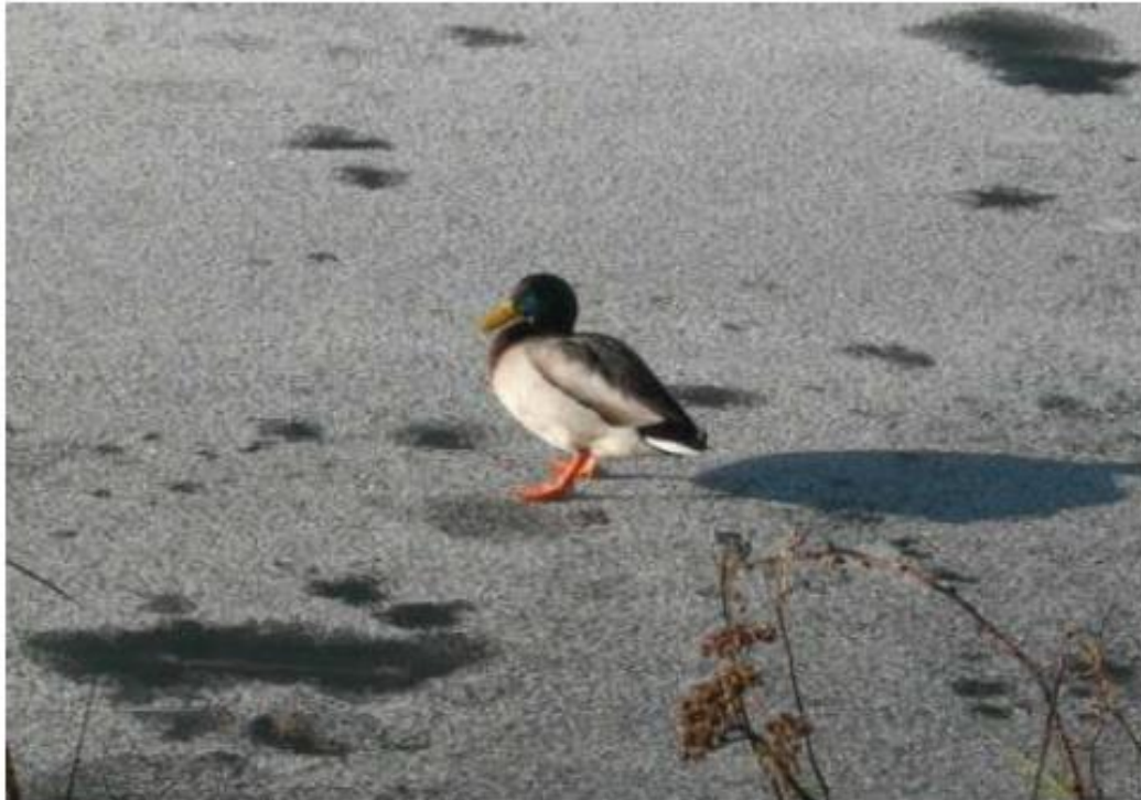
Male Mallard duck on the frozen lake on Milton Common