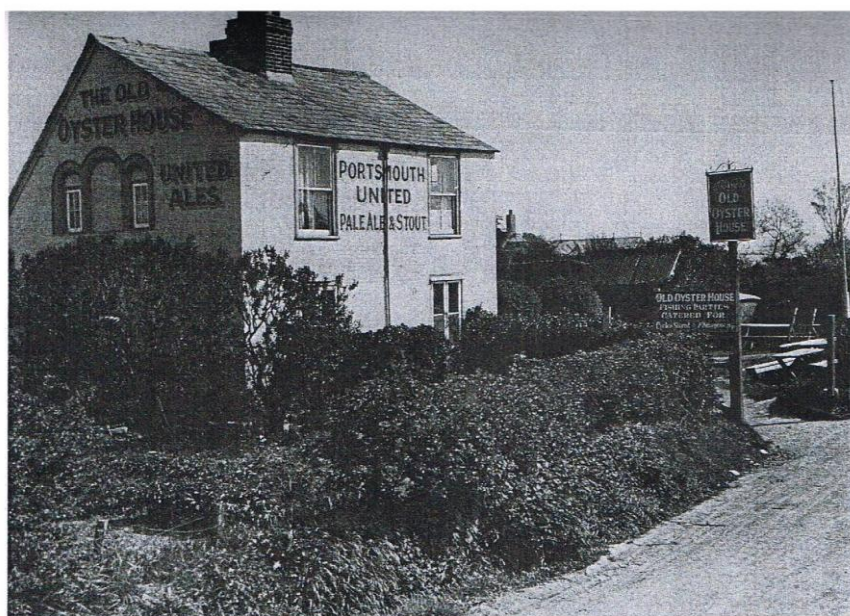
The Old Oyster House public house — at the bottom of Locksway Road — between the wars.