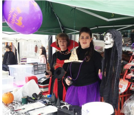
Izzy Wizzy Witch entertains 150 fans