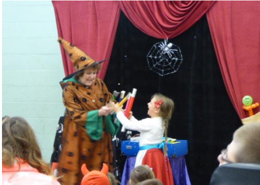
shop team offers witches hats

On 31 October 2015 a great new event was held in Eastney Road involving the local traders, Beddow Library, Eastney Community Centre and the Fort Cumberland Arms. It was an opportunity to show us how easy it is to walk to our own Milton Market and enjoy all the facilities it has to offer. It was not practical nor affordable to close off the main road, but instead families walked along the trail from the Library where they enjoyed spooky stories and games, down to the shops offering a treasure hunt, craft activities, decorating pumpkins, making witches hat bird feeders, taking in face painting then on to the Community Centre for stalls, entertainment and a bouncy castle in the pub garden.