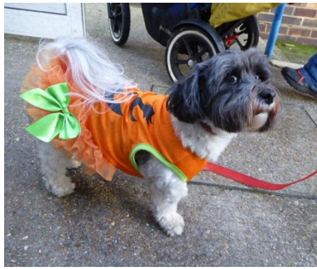
All dressed up for Halloween

This event would not have been possible without the hard work of everyone involved. The shops were beautifully decorated and extra activities put on. Phix-Pix designed great posters and put the event onto the internet. A grant of £500 from Love Your Street provided money for St Johns Ambulance, poster printing, balloons for street decoration and Izzy Wizzy Witch fee. The benefits to our area included 1140 people attending the Library that day, instead of 200 who normally go in on Saturdays. The local shops did great trade and provided a huge hamper worth over £100 in gifts and vouchers as the treasure hunt prize. The verdict at the end of the day, was 'when can we do it again?' so watch the Boards.