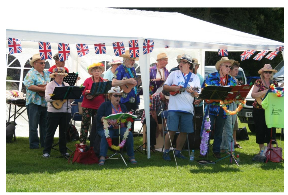
The Pompey Pluckers entertained us splendidly

Thanks are due to everyone who helped set up, donate prizes, make teas, run stalls, make the announcements, organise games and clear up too! Keep 20 June free in your 2015 diary when we hope to have your support again for more fun in the sun (fingers crossed)