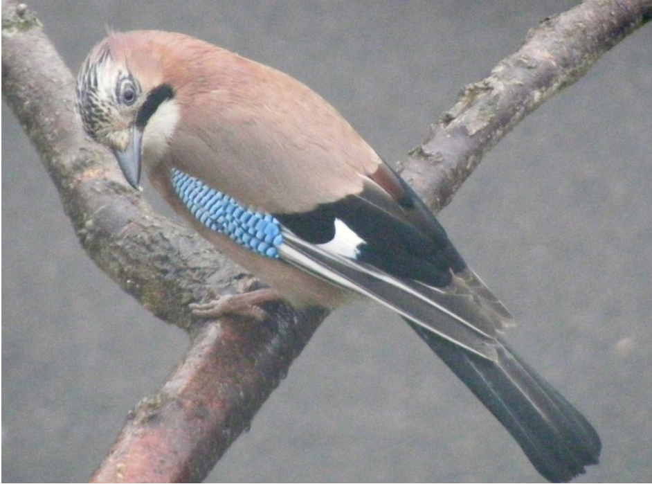
A LOCAL VISITOR TO A MILTON GARDEN One of a pair of jays who regularly feed there